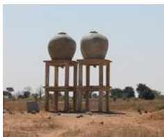
10,000 Ltr Tanks