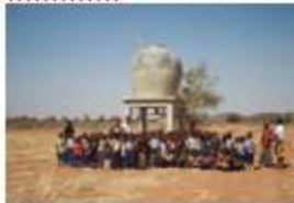
New Water Tank