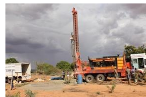
Water well for POP & Village