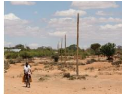
Power Poles to Amani