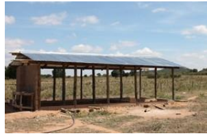
Second Chicken Shed