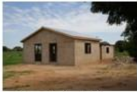
New Grain Mill