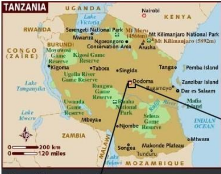
Map of Tanzania