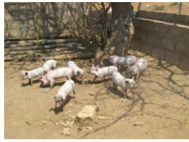
26 New Piglets