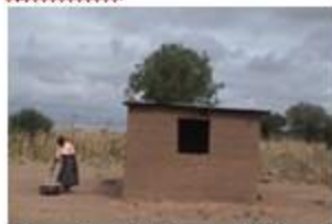
Teacher Office and Store