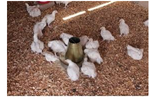
Chicken Project Hens