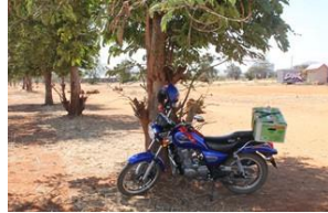
New Motor Bike