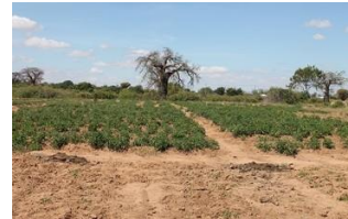
New Tomato Crops