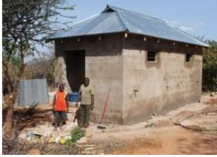
New Guest Toilet