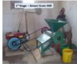
1 st Stage Grain Mill