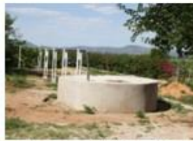
In-ground Water Tank