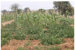
Vegetable Garden Area