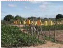
Primary School Garden