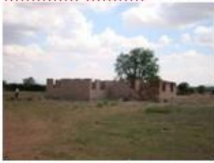
Beginning Children's Home