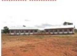
Classrooms - Prince of Peace Primary School