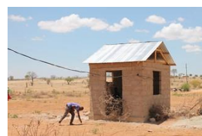
Power shed for new well