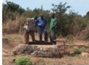
Old well bore to cleanup