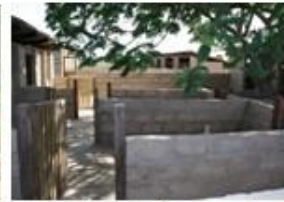
4 th Pig Sty In-ground