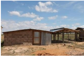
First Chicken Shed