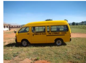
POP New School Bus