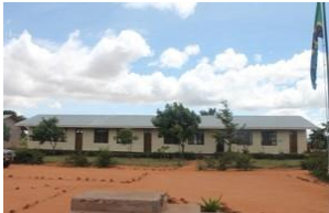
MM School 3 rd Bldg Roof