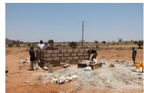
POP Power Shed