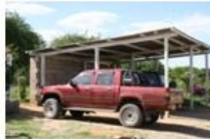
New Toyota Twincab