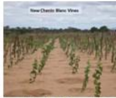
New Chenin Blanc Vines