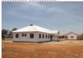
Admin & Kitchen