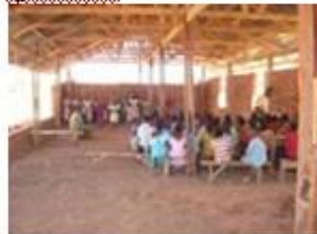
Multi Purpose Bldg