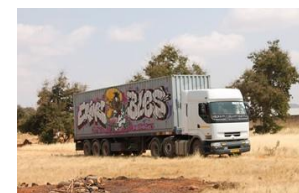
POP gets school supplies