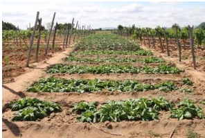
Chinese Cabbage & Okra