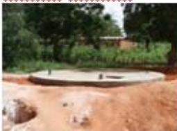
In-ground Water Tank