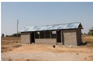
New Chicken House