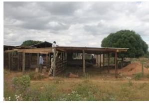
Hay Shed Extension