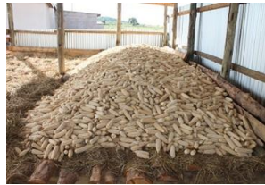
Maize Drying on "Banda"