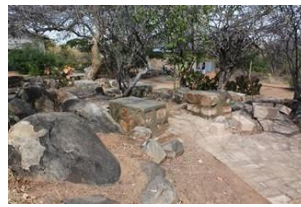
Guest Area Garden