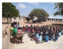
Classrooms & Students