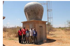
Electricity Shed at well