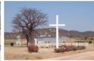
Entry to Amani Center