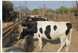
The new Feeding trough