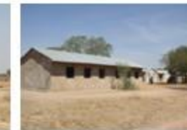
New Double Classroom