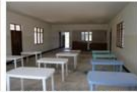
Multi Purpose Bldg