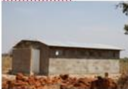
New Toilet/Bath Bldg