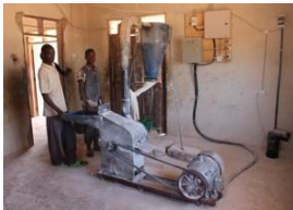
Electricity at the Mill