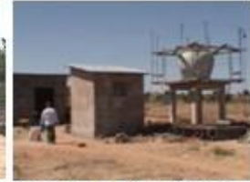
Well House & Water Tower