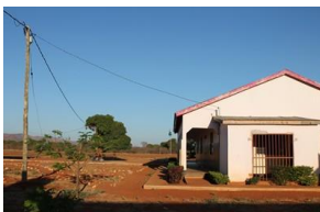
POP Power hook-ups