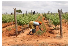
Tomatoes in Grape Rows