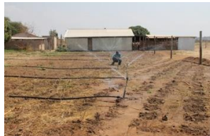
Sprinklers for forage