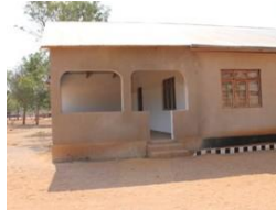
POP Veranda Area