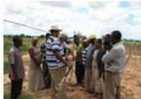
Grape Pruning Seminar