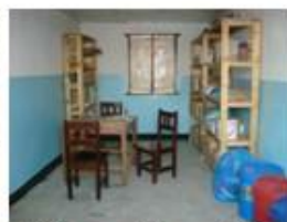
Children of Peace Office