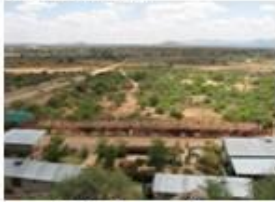
Main House Area