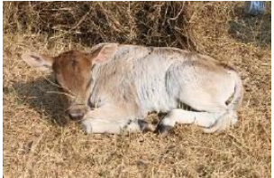
New calf more to come