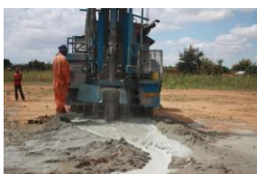
Drilling New Well