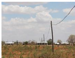
Electric Power lines