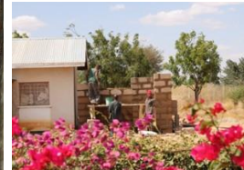
Building Legal Office