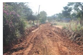
New Road to POP