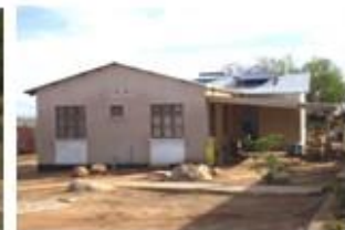
Kitchen & Porch Addition