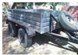
Hen Transport Trailer