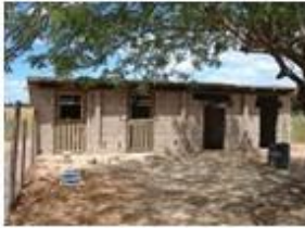
First "Pig Sty"