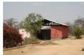
Tractor Shed & Storage