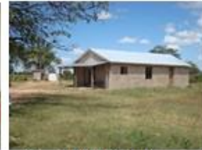
Grain Mill Building