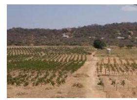
Amani Crop Expansion