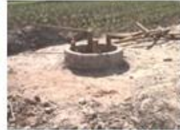
Restored Traditional Well