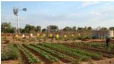
Windmill and Garden Area