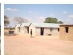
Classrooms & Buildings