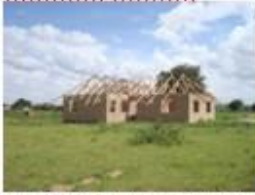
Beginning Roof Project