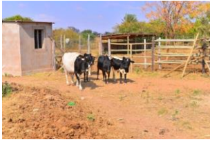
6 New Dairy Cows