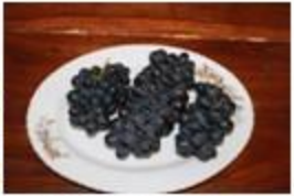
Black Rose Table Grapes