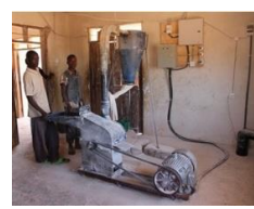
Grain Mill Electricity