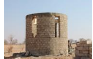
New 20 Ltr water Tank