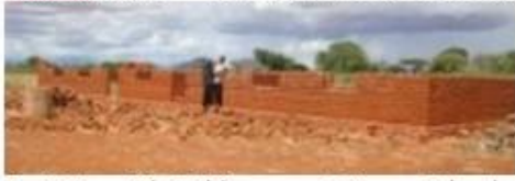
Assisting with Building new Primary School