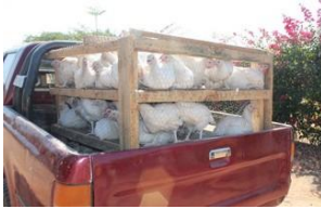
Hen Transport Container