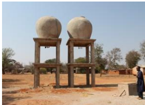
Preschool Water Tanks