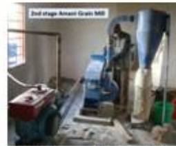
2 nd Stage Grain Mill