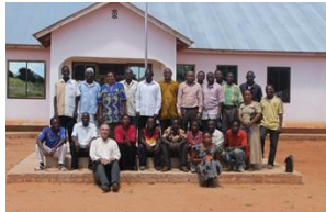
POP Staff/Village Leaders