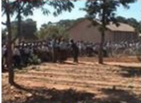
Garden at school