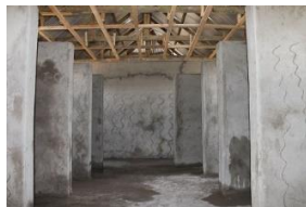
New DCMP Toilets