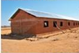
Primary School Roof