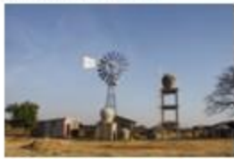
Triple Water Tower