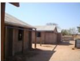
Gutters to collect water