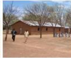
Roof St. Andrew's Church