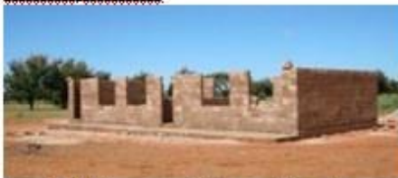
Building new Primary School