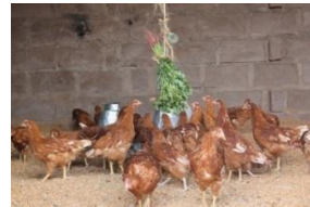
Hens at the DCMP