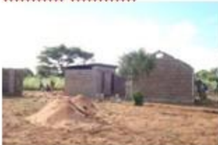
Well Keeper's House