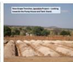
New Grape Trenches, Igondola Project - Looking towards the Pump House and Tank Stand