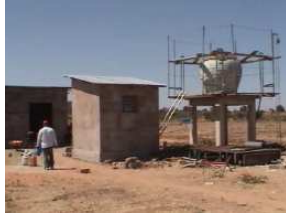
Well House & Water Tower