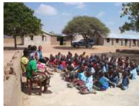
Classrooms and Students