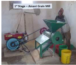
1 st Stage Grain Mill