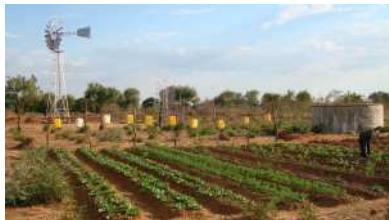
Windmill and Garden Area