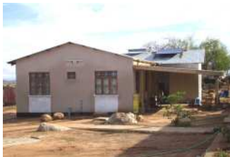
Kitchen & Porch Addition