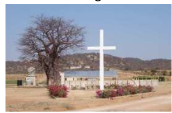
Entry to Amani Center