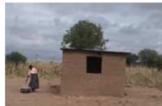
Teacher Office and Store