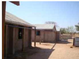
Gutters to collect water