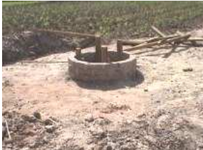
Restored Traditional Well