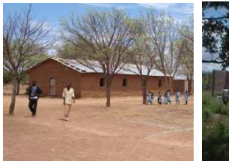
Roof of St. Andrew's Church