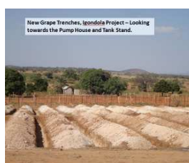
New Grape Trenches