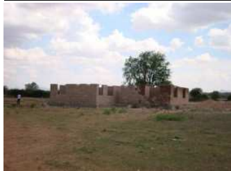
Beginning Children's Home