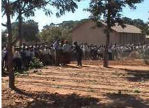
Garden at school