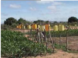
Primary School Garden