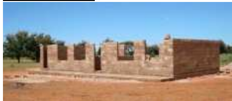
Building new Primary School