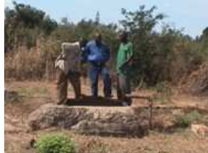
Old well bore to cleanup